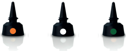
CryoPen/b applicators Orange: 1-4 mm, White 2-6mm, Green: 4-8mm